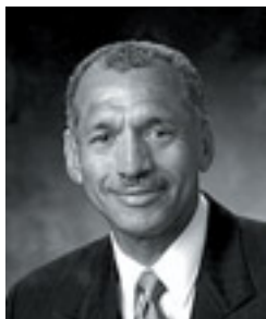
Charles F. Bolden, Jr.