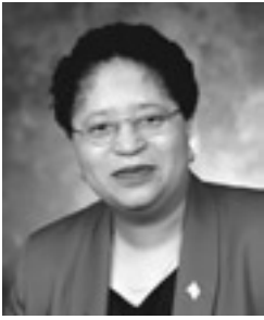
Shirley Ann Jackson